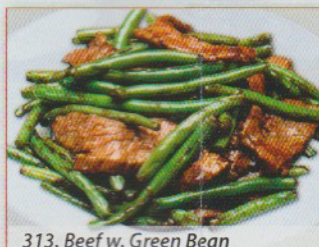
313. Beef w. Green Bean