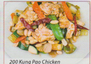
200 Kung Pao Chicken