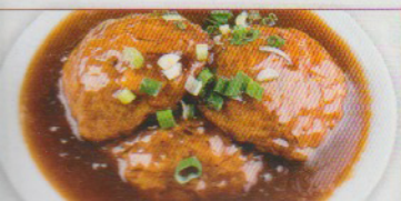
40. House Special Egg Foo Young