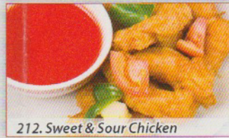
212. Sweet & Sour Chicken