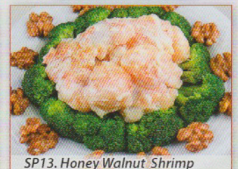
SP13. Honey Walnut Shrimp