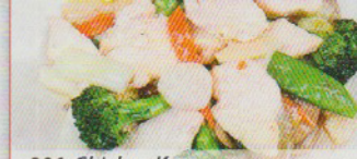
206. Chicken Kow