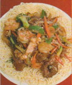
65. Cantonese Chow Mein