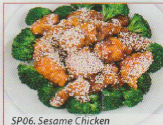
SP06. Sesame Chicken