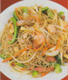
58. Singapore Noodle