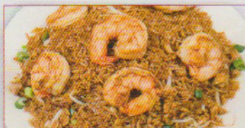
31. Jumbo Shrimp Fried Rice