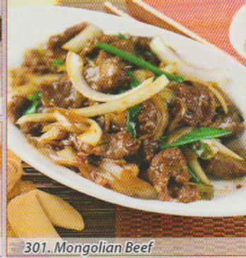
301. Mongolian Beef