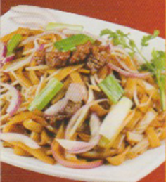
53. Beef Chow Fun