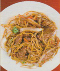
77. Beef War Mein