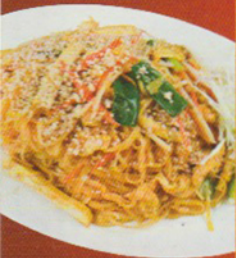
103. Chicken Thai Noodle